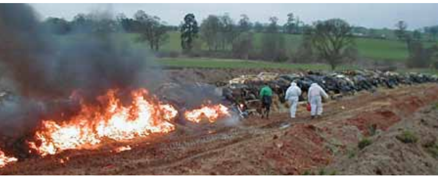
Scenes such as this one from the United Kingdom in 2001 probably could be avoided in the United States with a quick, strategic response to an FMD outbreak.