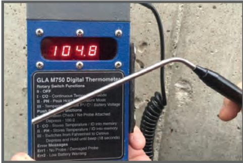
Fever (103 – 106°F)