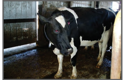
Will not move, depressed