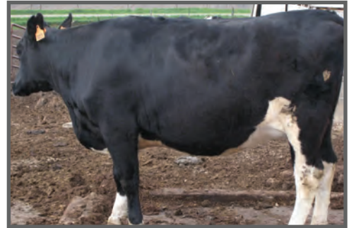
Will not eat